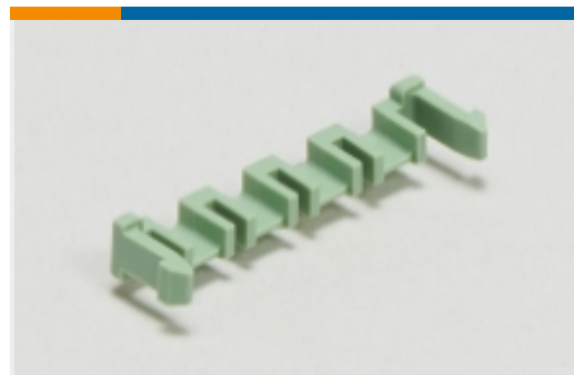
PCB Latches, Locks & Retainers(49)