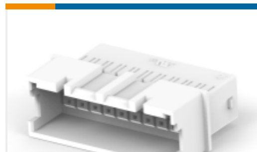
TE Part # 2-2324582-0 HSG,REC,FREE-HANGING,DUALROW,EP2.5