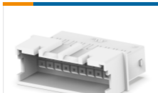
TE Part # 1-2324582-8 HSG,REC,FREE-HANGING,DUALROW,EP2.5